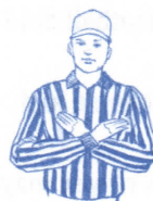
Delay of game