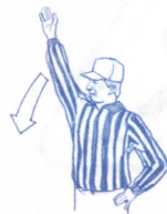
Ball ready for play