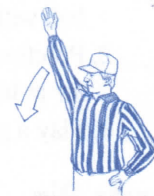
Penalty declined; no play