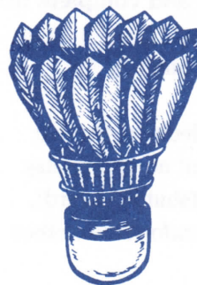
Traditional feather shuttle

Smash: Hit hard and down to put the shuttle away.